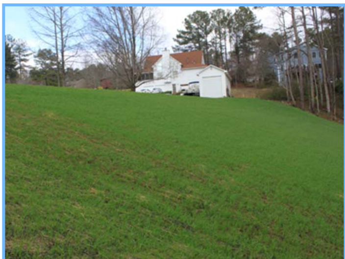
Noonday No. 17 in April 2011 after repairs.

Repairs to Noonday Creek watershed structure No. 17 were completed under partnership with the Georgia Soil and Water Conservation Commission and Natural Resources Conservation Service. The damages sustained by the dam were a result of the September 2009 flooding.