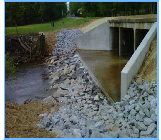
Completed debris removal at EWP site in Cobb County.

The Continuous Conservation Reserve Program, Emergency Watershed Protection Program, EQIP are NRCS programs implemented in Cobb County in the recent year.