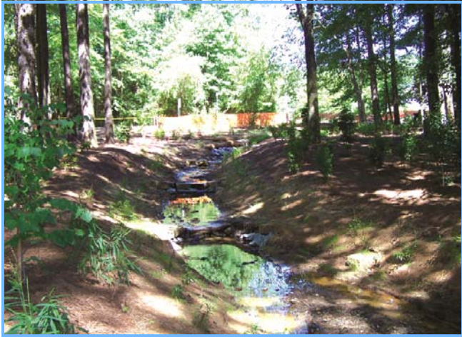
Repairs at Shaw Park

In September 2010, stream bank restoration and repairs were completed at Shaw Park.