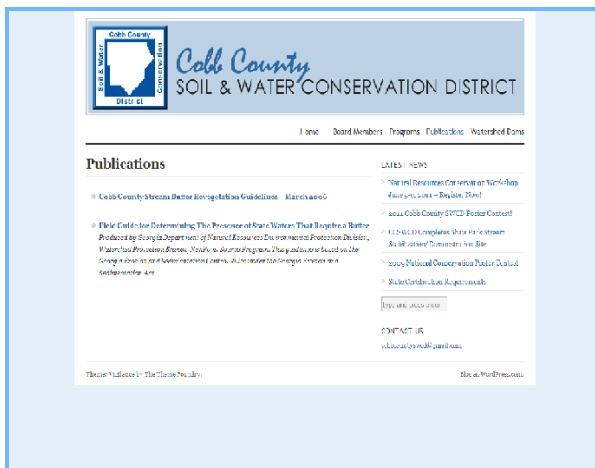
The District website can be found at www.cobbswcd.org

The CCSWCD website is maintained in order to provide conservation resources and materials including the District's Guideline for Native Vegetation and Stream Bank Restoration.