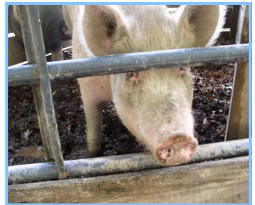
Photos taken at Bray Family Farms in Cobb County.