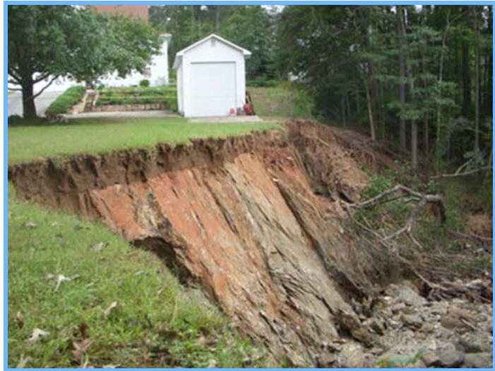
Noonday No. 17 following September 2009 flood damage.

The District partnered with the Georgia Environmental Protection Division (EPD) Safe Dam Program and Cobb County to inspect four District sponsored dams.